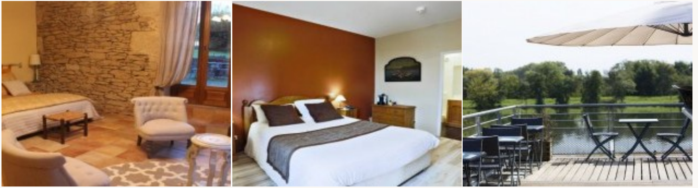
* Example of the type of accommodation