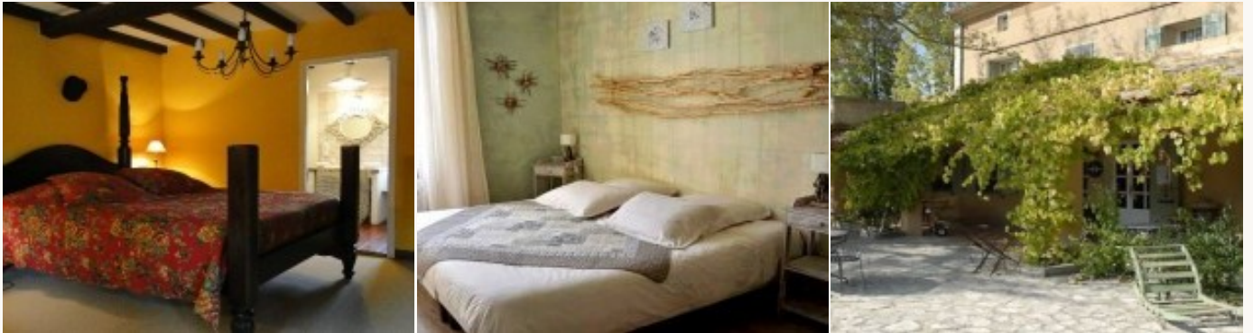
* Example of the type of accommodation

You'll get a good night's sleep when you stay in these 3-Star hotels of Bed and Breakfasts. All properties have been selected for their cleanliness, style and friendliness of the staff. A hearty breakfast is included! One night is spent in a typical provincial wine estate with a swimming-pool. The owner will be glad to show you around and have you sample the wines.