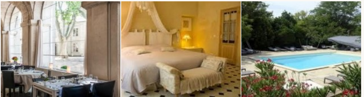
* Example of the type of accommodation

You'll enjoy a higher level of service in these 3-4 Star properties. Some nights you'll stay in a luxurious Bed and Breakfast and other nights in a hotel in an exceptional setting. Properties are selected for their high standards and impeccable service. This category is for guests looking for a higher-end vacation with a swimming pool every night. Of course, breakfast is included daily.