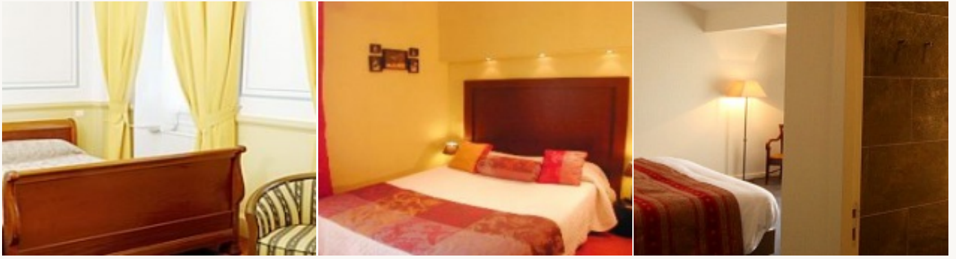
* Example of the type of accommodation