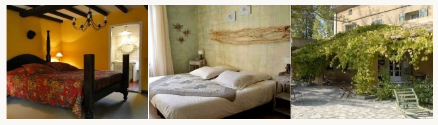
* Example of the type of accommodation

You'll get a good night's sleep when you stay in these 3-4Star hotels of Bed and Breakfasts. All properties have been selected for their cleanliness, style and friendliness of the staff. A hearty breakfast is included! One night is spent in a typical provincial wine estate with a swimming-pool. The owner will be glad to show you around and have you sample the wines.