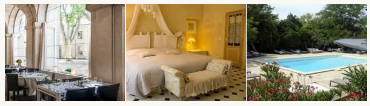
* Example of the type of accommodation

You'll enjoy a higher level of service in these 3-4 Star properties. Some nights you'll stay in a luxurious Bed and Breakfast and other nights in a hotel in an exceptional setting. Properties are selected for their high standards and impeccable service. This category is for guests looking for a higher-end vacation with a swimming pool every night. Of course, breakfast is included daily.