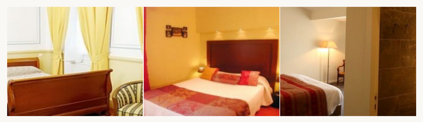
* Example of the type of accommodation

One night is spent in a typical provincial wine estate where the owner will be glad to show you around and have you sample the wines.