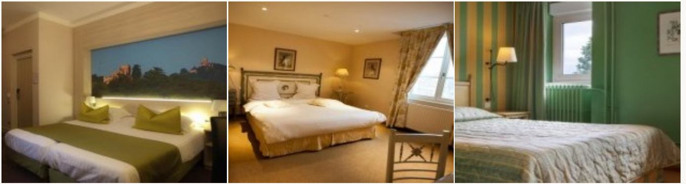
* Example of the type of accommodation

You stay in hotels with *** standards selected for their style and quality. Breakfast is included.