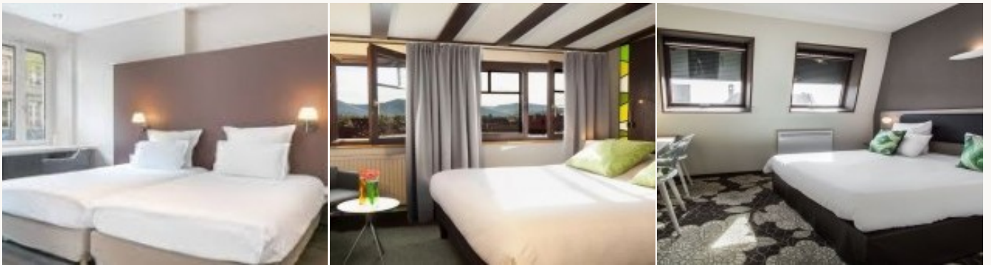
* Example of the type of accommodation

You will enjoy a higher level of service in these ***/**** hotels. Breakfast is included.