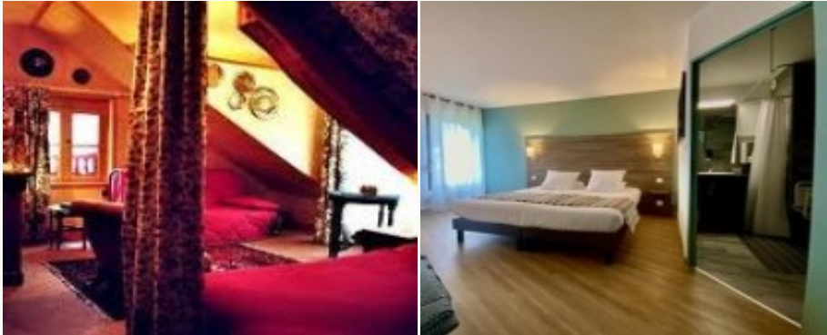
* Example of the type of accommodation

You'll get a good night's sleep when you stay in these 2 or 3 Star hotels or Bed and Breakfasts. All properties have been selected for their cleanliness, style and friendliness of the staff. A hearty breakfast is included!