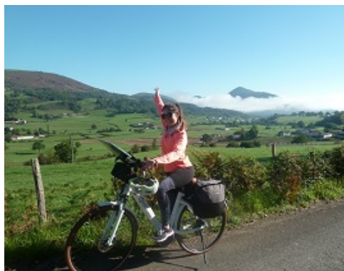
Type of stay loop trip

From Biarritz, this cycling holiday takes you along the Basque country coast and through its majestic countryside at the foothills of the Pyrenees. This cross-border region has kept a strong identity and a sense of enjoying life that is contagious on a bike trip there!