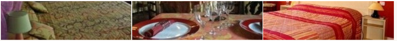
* Example of the type of accommodation