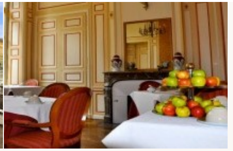
* Example of the type of accommodation